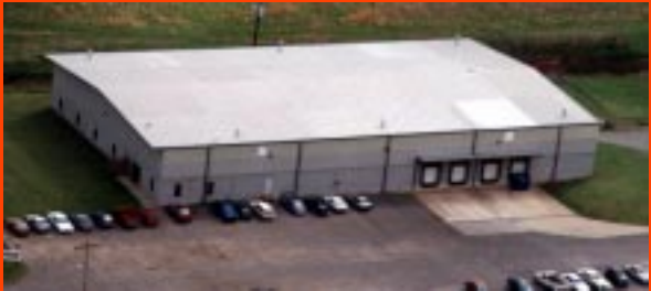
Cissell Distribution Center Portland, Tn. U.S.A.

Our purpose is to provide laundry equipment and services which exceed out customers expectation for performance and durability