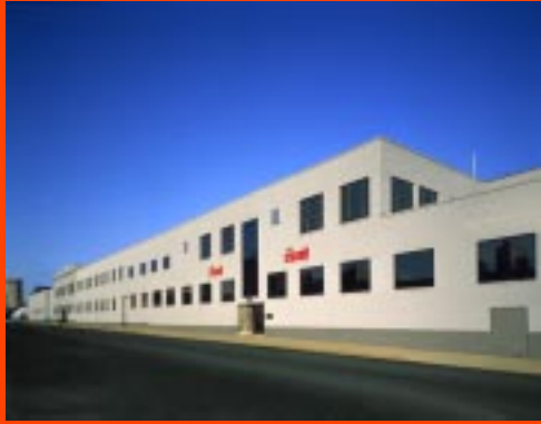
Cissell World Headquarters Louisville, Ky. U.S.A.